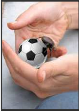
Dung Beetle @ work